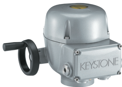
Keystone EPI 2 Electric Actuator