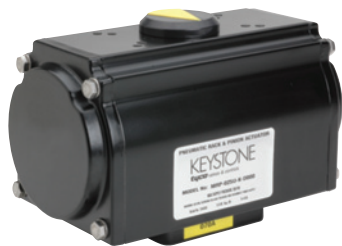
Keystone MRP Pneumatic Rack and Pinion Actuators

Tyco Flow Control offers a complete line of actuation and controls to meet all your automation needs. This allows us to supply a complete package for single source responsibility.